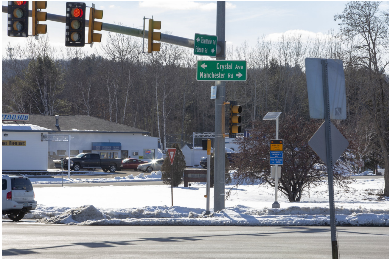
Photo of the intersection of Tsienneto Road, Folsom Road, Crystal Avenue, and Manchester Road.

The third and final major construction project, 13065C, is in the early stages of final design. The design schedule is set to follow the ROW acquisition schedule for the corridor. This project is expected to advertise in early 2025.